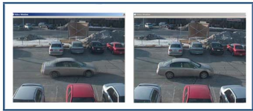
Interlaced Scan video (left) appears blurry on a PC monitor, whereas Progressive Scan video yields a clear, undistorted image (right).

NOTE: This setting is important only if you are using 480 x 576 lines of resolution (NTSC/PAL): 4CIF, 2/3 D1, All Lines (HD1), or VGA.