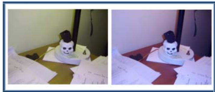
Left: with White Balance in incandescent lighting; right: without Light Balance

To adjust colors based on lighting conditions and compensate for ambient light color, use the White Balance Bias . The best way to adjust this setting is to place a white piece of paper over 25% of the image center and tweak the White Balance Bias to reproduce as closely as possible the color of the paper. Possible values range from -2,000 to 2,000. A negative offset adds a blue tint to the image, whereas a positive value adds red.