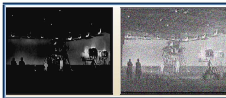
Without gain boost

The Day/Night Gain Boost will increase the video gain by 6 dB when entering night mode to increase contrast. It will boost existing video signals, but also amplify the internal noise, so use carefully.